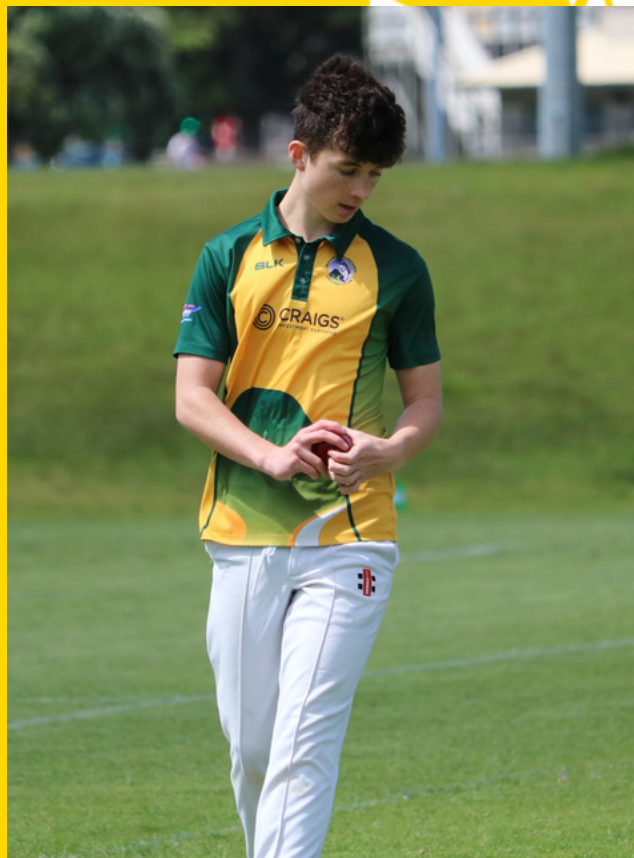
These teams had the following results for the 2021/22 Season: