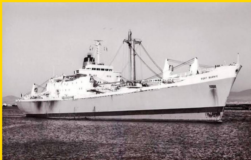
'PORT BURNIE' IN ALL HER GLORY