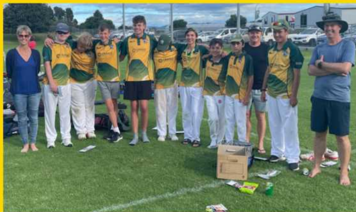
THE MMCC COLLEGE PREMIER TEAM IN 2021/22