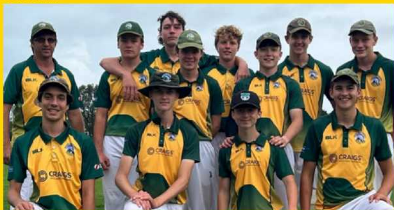
MMCC 4TH XI, PREVIOUSLY KNOWN AS "INANGA".