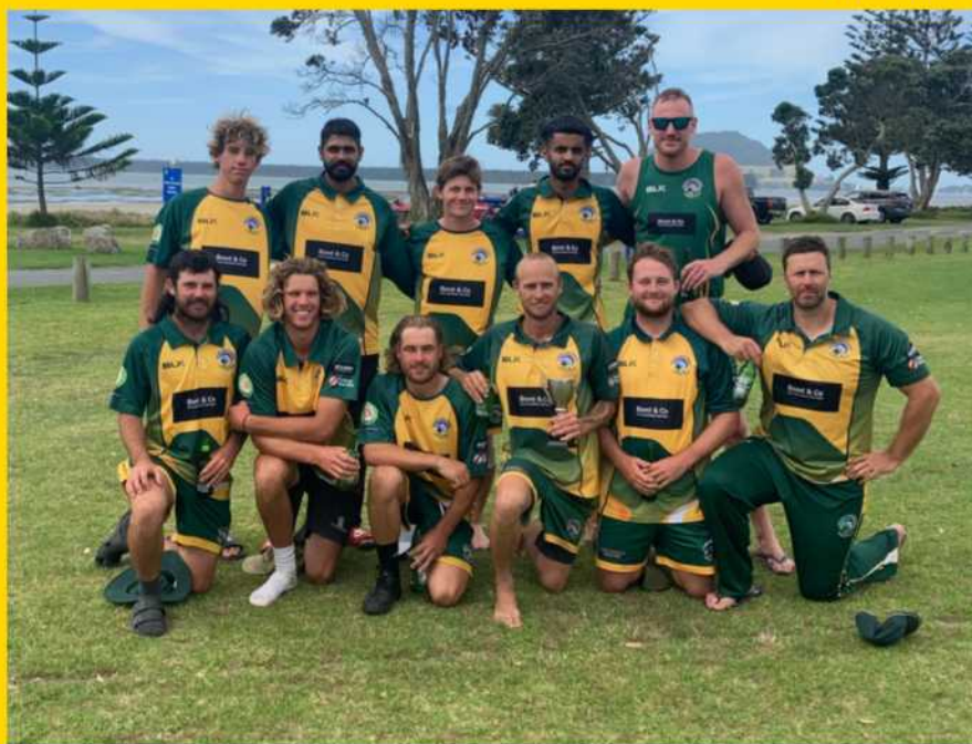
THE MMCC 2ND XI BROUGHT HOME THE RESERVE GRADE TWENTY20 CUP IN 2021/22

Another challenging summer on the horizon but the lads will be looking to keep striving forward.